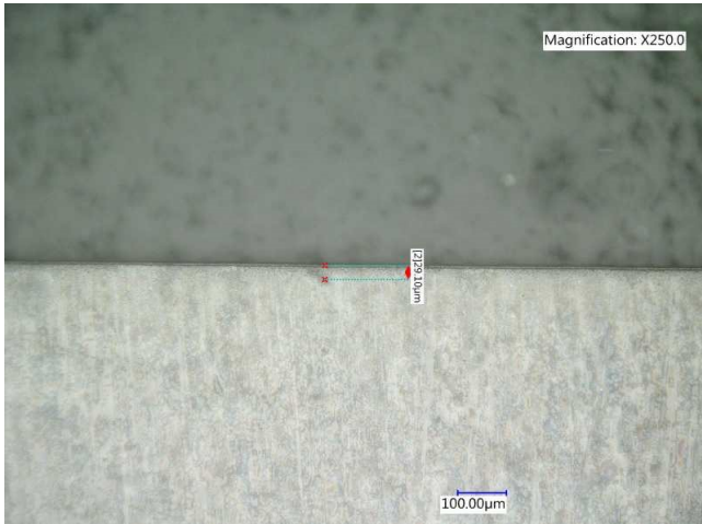
Figure 3. Improved cut quality and a dust zone reduced to \approx 29 micron using our green wavelength ORIGAMI XP laser.

We made the straight-line cut, shown in Figure 3, using the ORIGAMI 05XP green laser. It did indeed show improvement in the cut quality, with a reduced dust zone of \approx 29 microns.