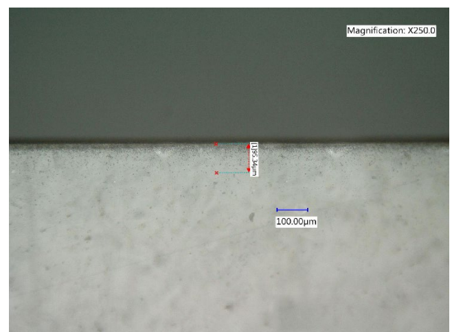
Figure 2. Redeposition of loose dust created a dust zone of \approx 95 micron extending from the cut edge.

A closer evaluation of a straight-line cut, see Figure 2, shows the redeposition of loose dust near the cut edge, creating a dust zone of \approx 95 microns extending from the cut edge.