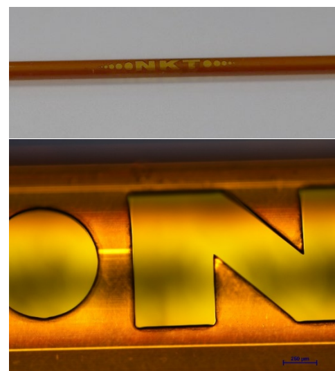
Figures 3 and 4. 50 \mu\text{m} wall polyimide tube using our ORIGAMI 10XP laser.