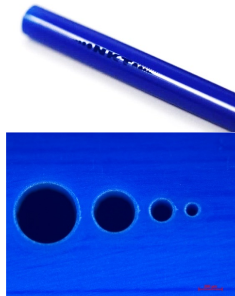
Figures 1 and 2. 200 \mu\text{m} wall blue nylon tube cut using our ORIGAMI 10XP laser.

Nylon tubing is ideal for medical devices because it is lightweight, corrosion and abrasion resistant. It can withstand repeated stress over extended periods. Its strength, crush, cracking and tear resistance makes nylon perfect as the outer jacket of catheters.