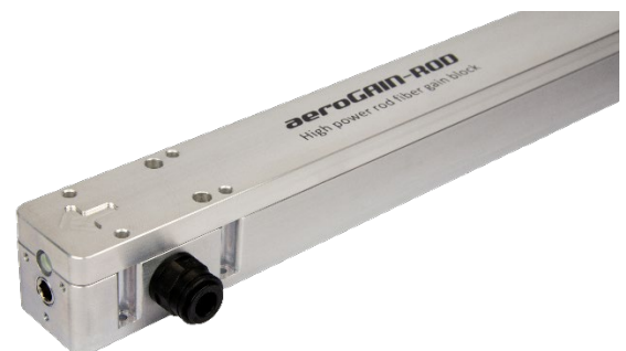
Figure 1: Picture of the aeroGAIN-ROD module.

The aeroGAIN-ROD fibers can be delivered mounted as aeroGAIN-ROD modules ensuring easy and secure handling as well as easy mounting and coupling. Figure 1 shows a picture of the aeroGAIN-ROD module. This ready to use solution ensures ROD fiber mounting without any stress introduced and protects the ROD fiber from the outer environment. The module has integrated water cooling with quick coupling giving efficient thermal management and long maintenance-free lifetime of thousands of hours. The module can be delivered with a ChromiAL TCP processed surface for industrial use by customer request. The aeroGAIN-ROD module has been severely tested with respect to climate change, vibration, and drop testing, and is very robust against transport and storage conditions. The module can tolerate large temperature changes from -30°C to 60°C and large vibrations, shock tested up to 1G at frequencies from 30Hz to 500Hz, without affecting the optical properties of the ROD fiber. Even when the module is packed for transportation it has been tested for drops of a few meters also without destroying the module or affecting the ROD fiber's optical properties. For specifications see the aeroGAIN-ROD module datasheet